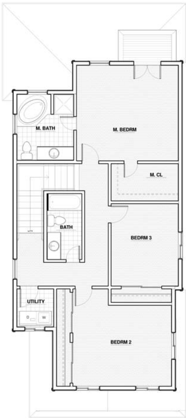
UPPER FLOOR PLAN 1108 sf.